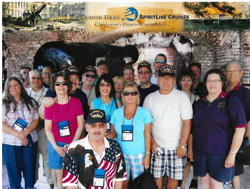
2009 Charleston, SC