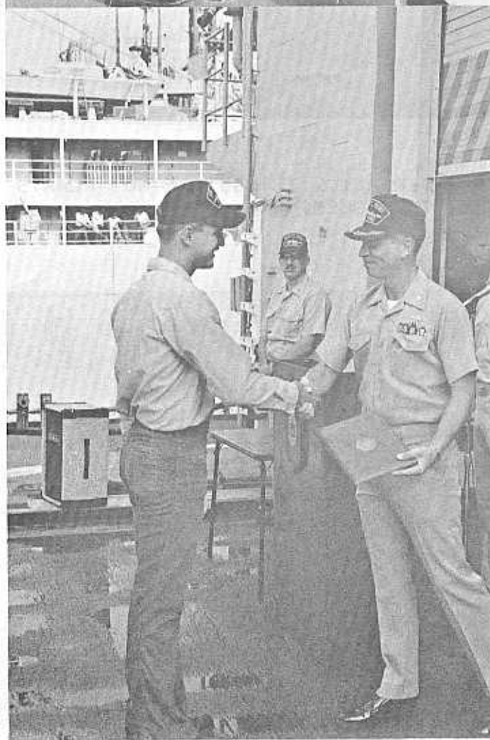
(CLOCKWISE FROM ABOVE): YN3 TYLER AND PC3 DURAN GET FROCKED AND PN2 YOUNG GETS ADVANCED